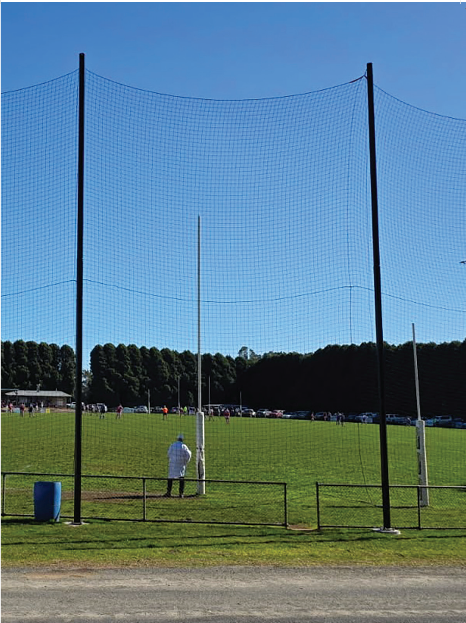
IMAGE: Ellinbank Junior Football Netball Club – Goal barrier net.