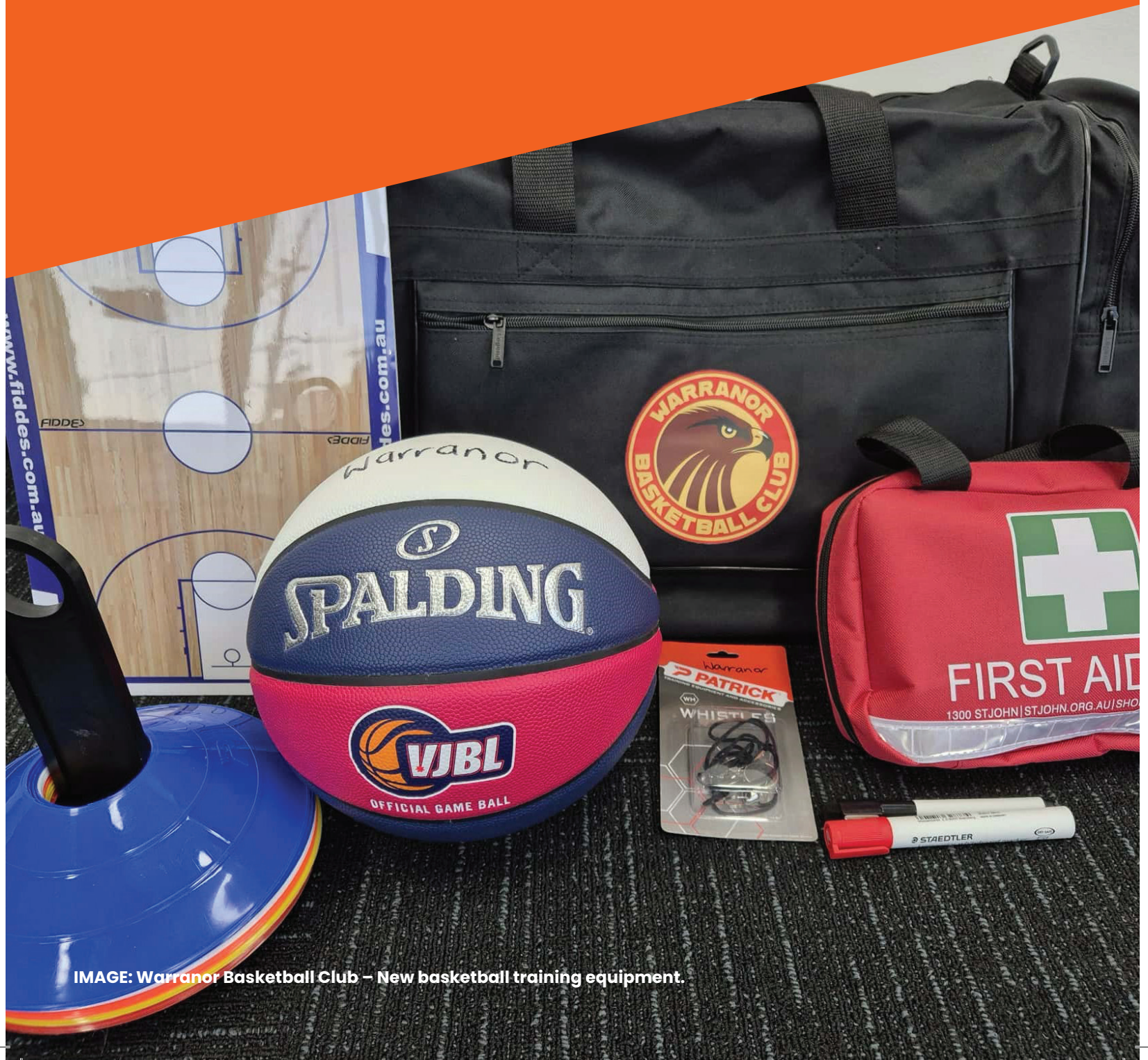
IMAGE: Warranor Basketball Club – New basketball training equipment.