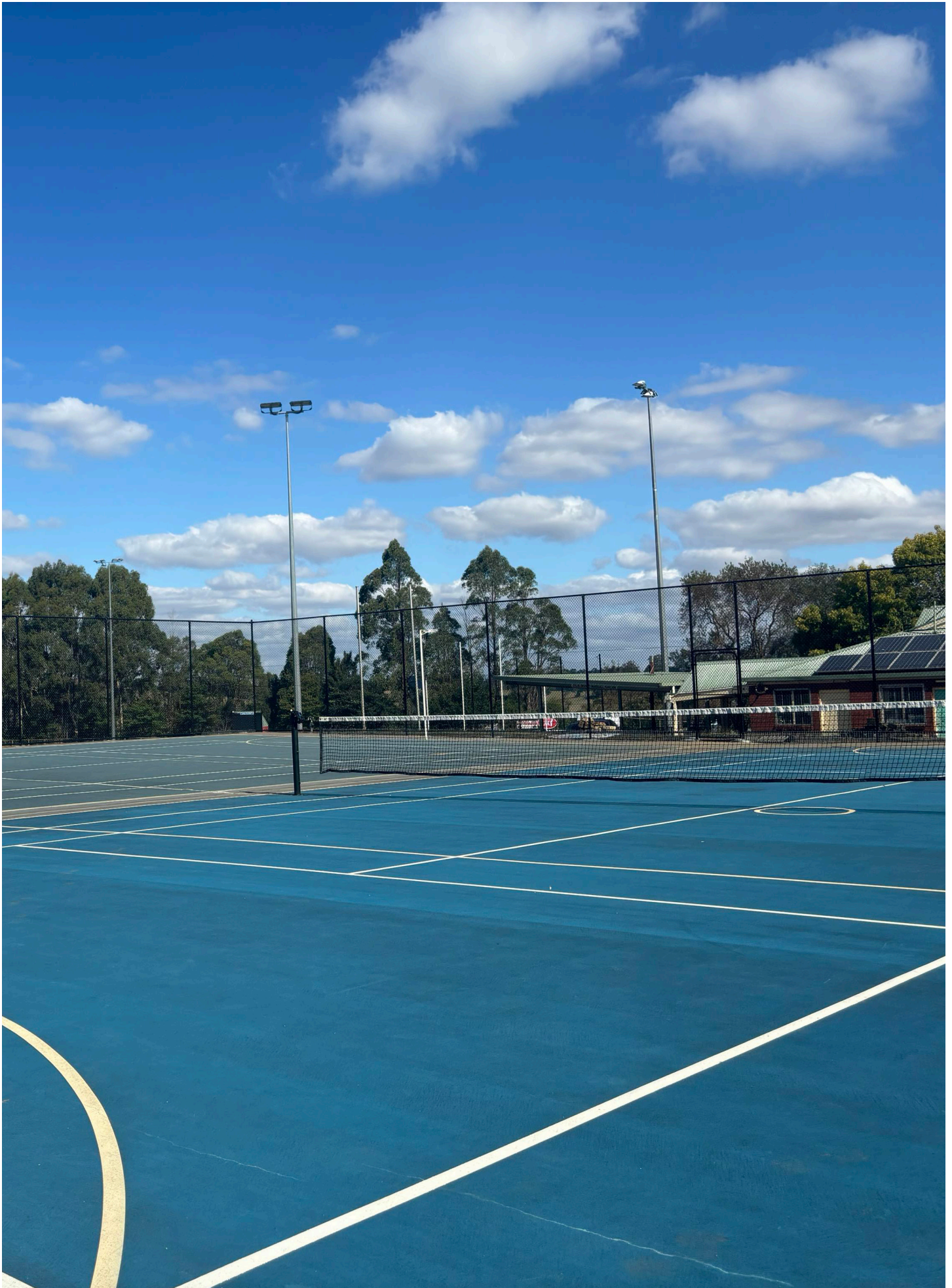
IMAGE: Neerim-Neerim South Football and Netball Club – “Netball & Tennis Court Fence Renewal Project” to replace the existing Netball and Tennis court fence on the North, South and East sides of the courts at the Neerim South Recreation Reserve.