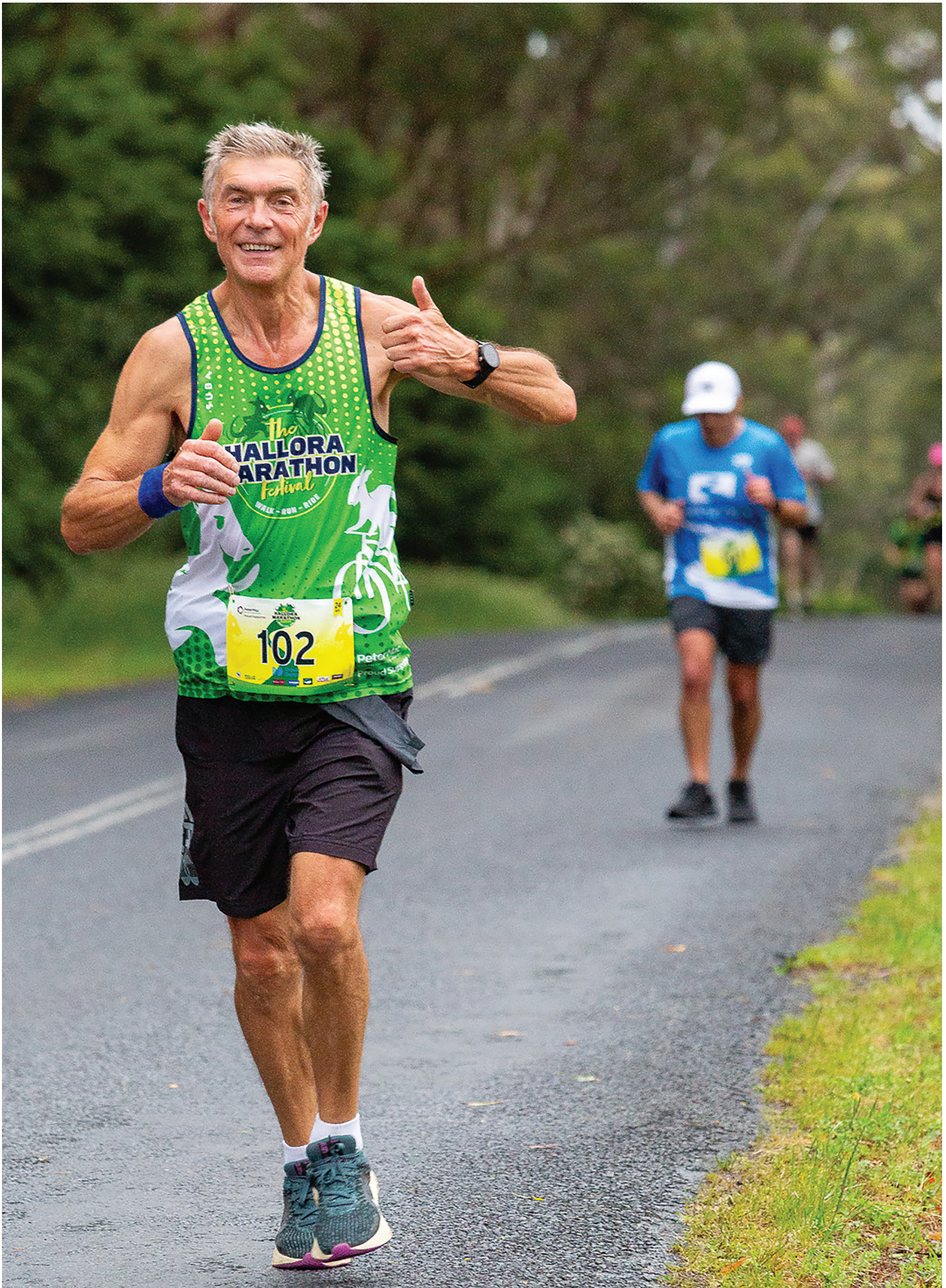
IMAGE: The Hallora Marathon Festival.