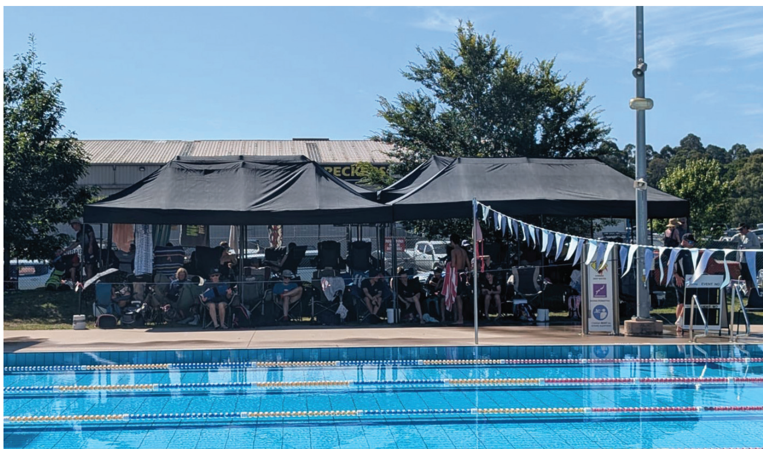
IMAGE: Warragul Leisure Centre – “Warragul Swim Club Shade Covers”