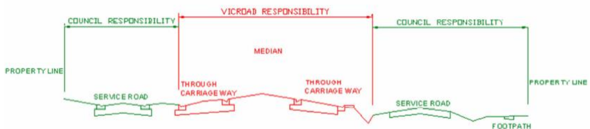
Figure 1: Typical VicRoads Declared Main Road in urban Areas (Source: Code of Practice Operational Responsibility for Public Roads).

Figure 1 below provides a typical road cross section which defines responsibilities.