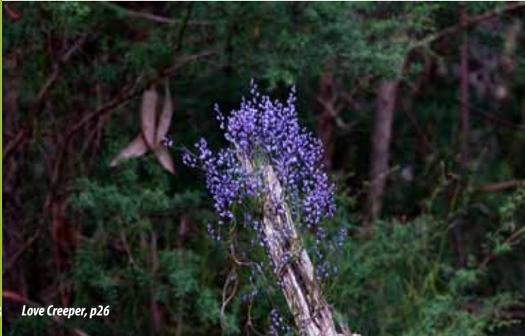
Love Creeper, p26

Our terrestrial orchids are threatened by urbanization, land clearing and climate change. More attention could be paid to orchid conservation.