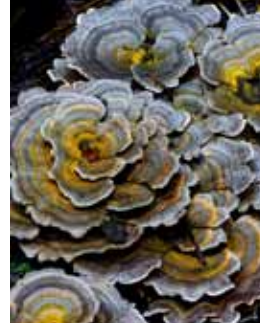
11. Rainbow Fungus