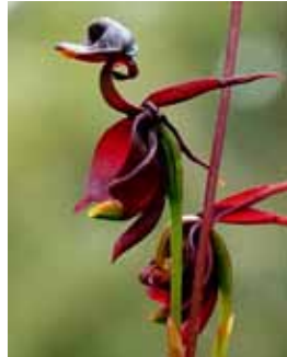
7. Large Duck-orchid

7 Large Duck-orchid: Caleana major , up to 50cm, sometimes 4-5 distinctively-shaped flowers, September to January, variety of habitats.