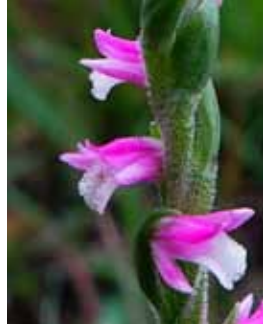
3. Austral Ladies Tresses

3 Austral Ladies Tresses: Spiranthes australis , 45cm, dozens of tiny flowers, December to February, in decline due to loss of swampy habitat.