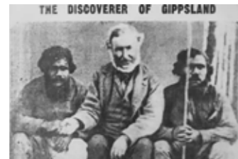
Angus McMillan c1900

The completion of the Melbourne to Sale railway in 1879 provided opportunity for the settlement of West Gippsland and many forestry and pastoral enterprises were established, some being still viable today.