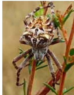
4. Orb Weaver