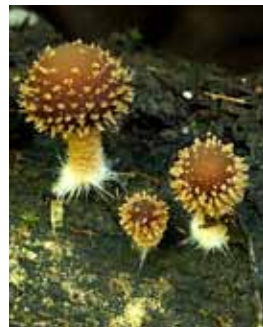
5. Golden Tufts

5 Golden Tufts: Cyptotrama asprata , caps usually only 2-3cm diameter, on decaying wood, always a delight to find.