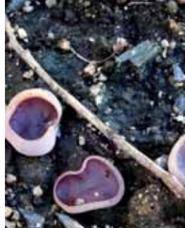
3. Purple Cups

3 Purple Cups: Peziza tenacella , cups to 30mm across (when open), gregarious in burnt ground after fire.