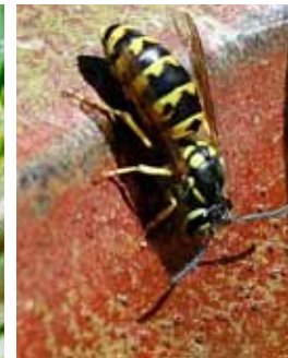
8. European Wasp