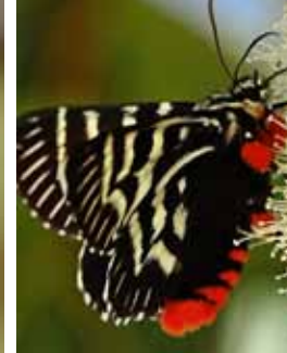
2. Mistletoe Moth