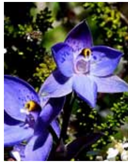
6. Graceful Sun-orchid

5 Fairy Fingers: Caladenia alata , 10cm, uncommon, flowers September to October, lowland forest and heathy woodland.