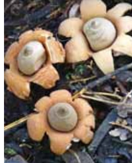
2. Earth Star

2 Earth Star: Geastrum triplex , 5cm diameter, grows in leaf litter and detritus, puffball - spore ejects through central hole.