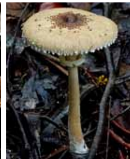
15. Slender Parasol