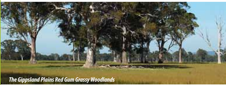
The Gippsland Plains Red Gum Grassy Woodlands