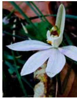
4. White Fingers

4 White Fingers: Caledonia catenata , 30cm, single flower usually, September to November, restricted to lowland forest in southern Victoria.