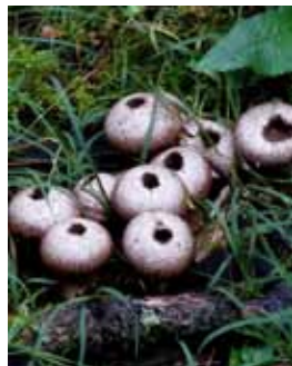
9. Pear-shaped puffball

9 Pear-shaped Puffball: Lycoperdon pyriforme , 2-3cm diameter, grows on wood, 'an upside down pear'.