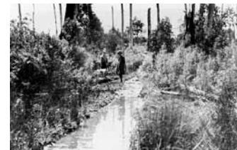
Early Drouin, Weebar Rd