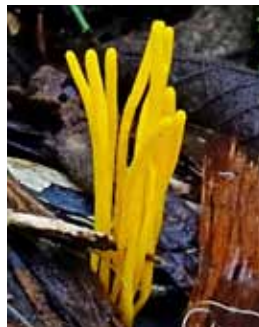
13. Yellow Club Coral