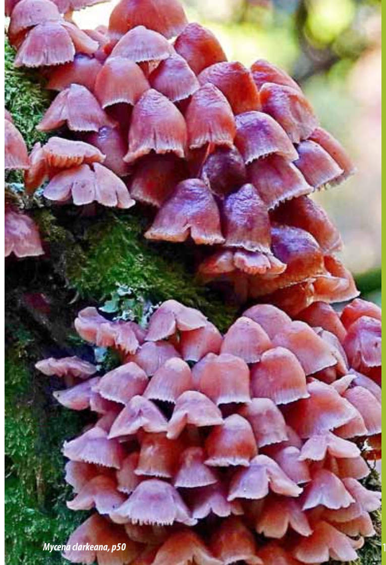
Mycena darkeana , p50

Parasitic fungi; feed on living plants and animals usually to the detriment of the host organism.