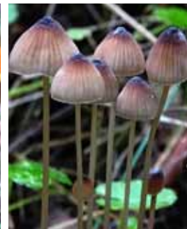
18. Tall Mycena