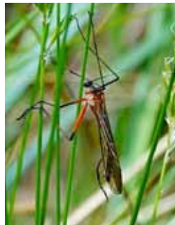
7. Crane Fly