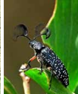
3. Feather-horned Beetle