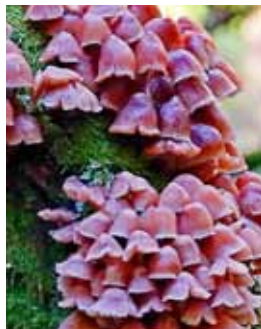
7. No Common Name

7 No Common Name: Mycena clarkeana , caps to 2cm diameter, grows in dense colonies on stumps, logs and dead trees.