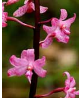
1. Rosy Hyacinth-orchid

1 Rosy Hyacinth-orchid: Dipodium roseum , to 1m tall, up to 50 flowers per stem, summer flowering, epiparasite, pollinated by native bees and wasps.