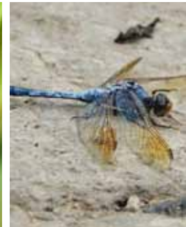
6. Blue Skimmer