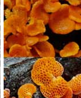
12. Orange Pore