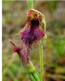
8. Purple Beard-orchid