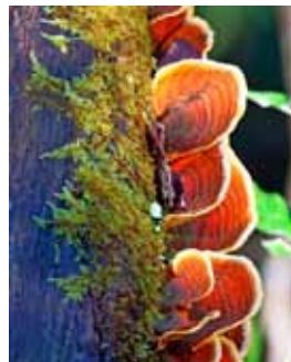
6. Golden Curtain Crust

6 Golden Curtain Crust: Stereum Ostrea , funnel-shaped fans 5-10cm across, on dead trees and logs.