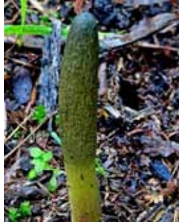
1. Dark Vegetable Caterpillar

1 Dark Vegetable Caterpillar: Cordyceps gunnii , 10-20cm tall, parasitizes moth larvae in the soil, grows under acacia species.