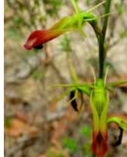
2. Large Tongue-orchid

2 Large Tongue-orchid: Cryptostylis subulata , 80cm tall, can have 10 or more flowers, November to April, pollinated by male Ichneumonidae wasp.