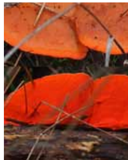
8. Scarlet Bracket

8 Scarlet Bracket: Pycnoporus coccineus , brackets to 10cm but variable, found in wet and dry forests and woodlands.