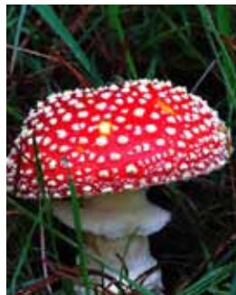
4. Fly Agaric

4 Fly Agaric: Amanita muscaria , 10-12cm diameter, grows in soil, introduced, the toadstool of fairy tales.