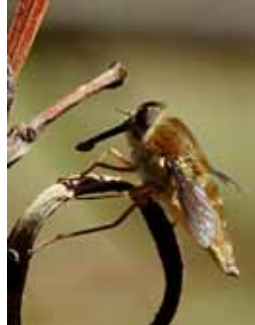
1. Bee Fly

9 Katydid Family Tettigoniidae . Related to grasshoppers and crickets. They eat other insects, leaves, nectar and pollen and are considered a beneficial insect.