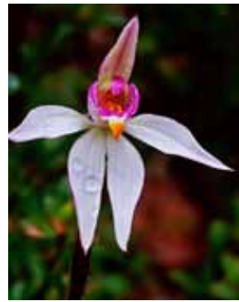
5. Fairy Fingers