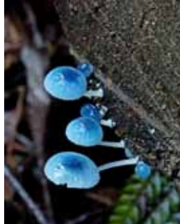
10. Pixie's Parasol

18 Tall Mycena: Mycena cystidiosa , can grow to 10cm high, grows in colonies in the leaf litter and wood on the ground.