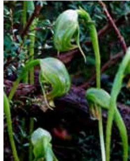
9. Nodding Greenhood

8 Purple Beard-orchid: Calochilus robertsonii , grows to 40cm with up to 8 flowers, September to January, widespread.