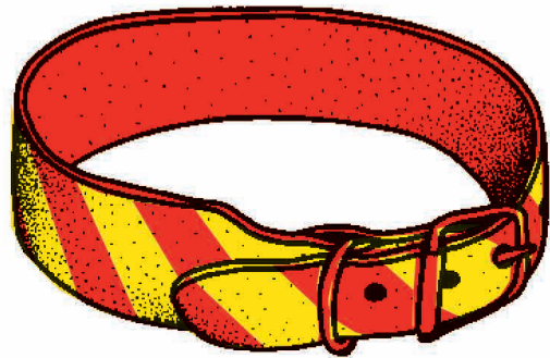
Figure 1. Example of a Declared Dangerous Dog collar