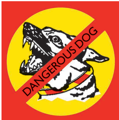
Figure 2. Example of a warning sign