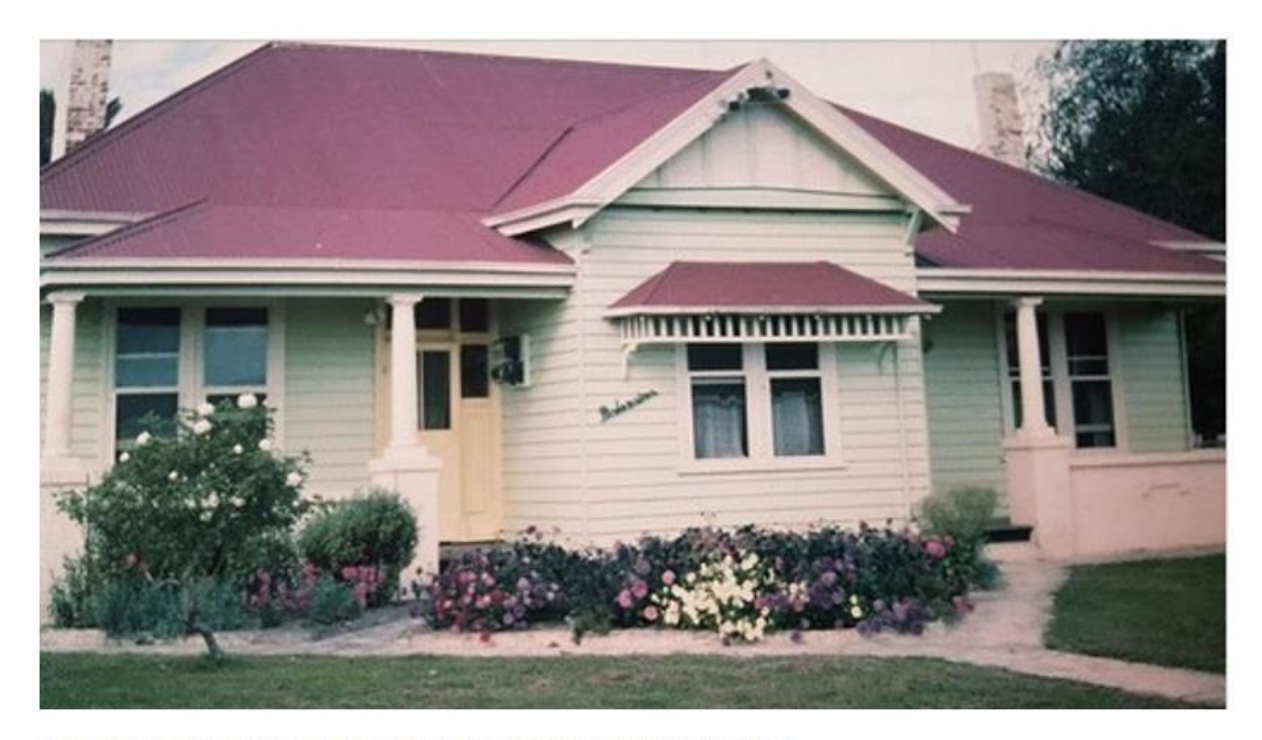
Figure 2 Deloraine, showing the house in the late twentieth century c.1970s (?)

Heritage Place: Deloraine homestead PS ref no: HO356