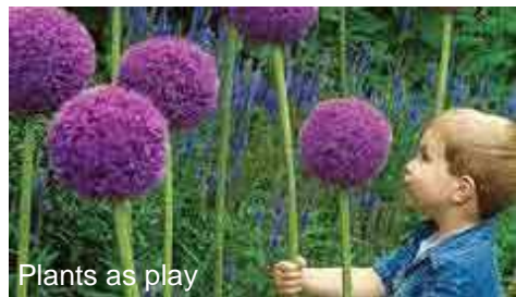
Plants as play