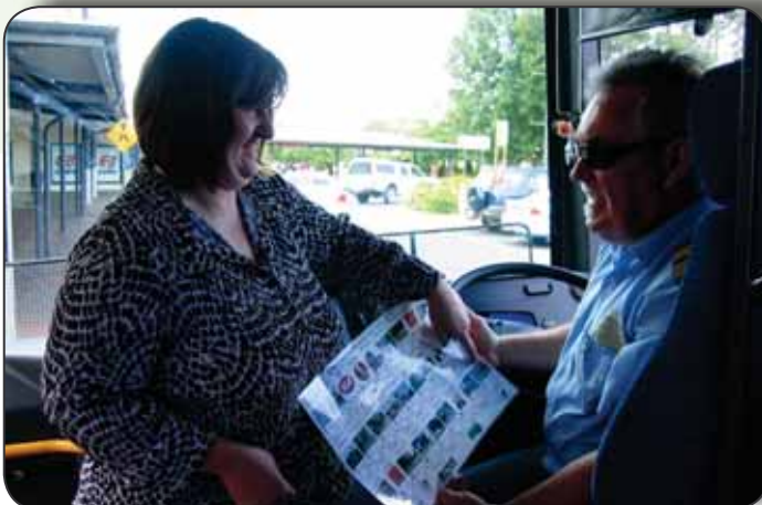
Bus user using Communication board