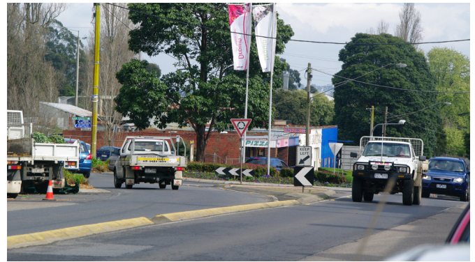
Image: Princes Way, Drouin