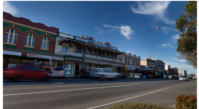
Image: Queen Street, Warragul