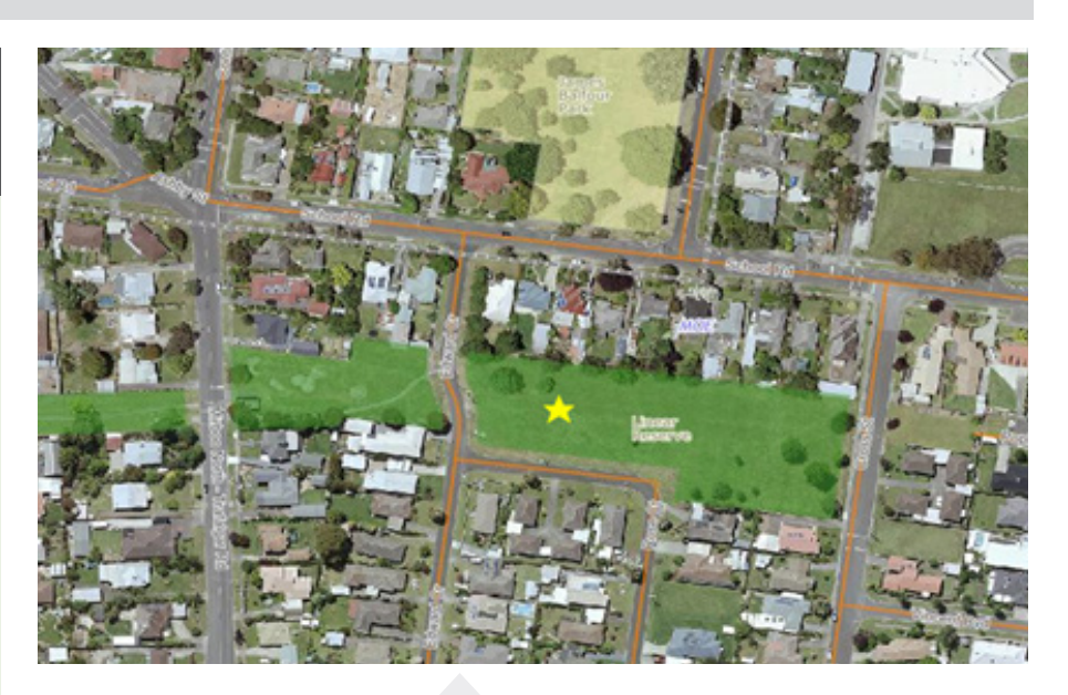
Image: The fully fenced dog park will be constructed in the area marked with a star, on the corner of Edward Crescent and Rose Court in Trafalgar.

To provide shade in warmer months and break up the wide open space.