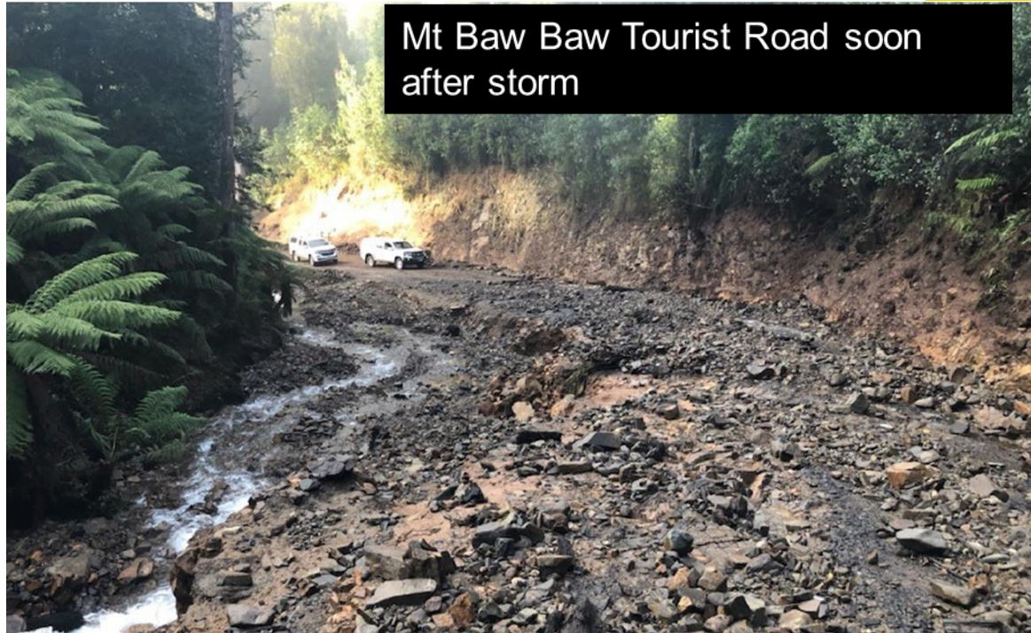
Mt Baw Baw Tourist Road soon after storm