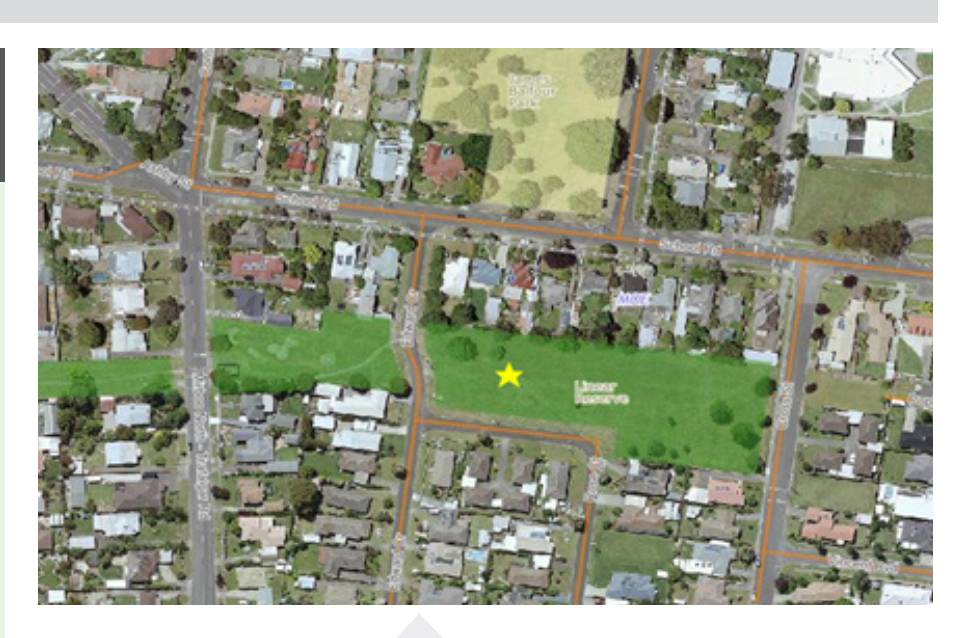
Image: The fully fenced dog park will be constructed in the area marked with a star, on the corner of Edward Crescent and Rose Court in Trafalgar.

Tree plantings To provide shade in warmer months and break up the wide open space.