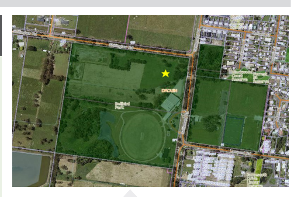
Image: The fully fenced dog park will be constructed in the area marked with a star, on the corner of Shillinglaw and Settlement Roads.

To allow for routine maintenance and waste collections.