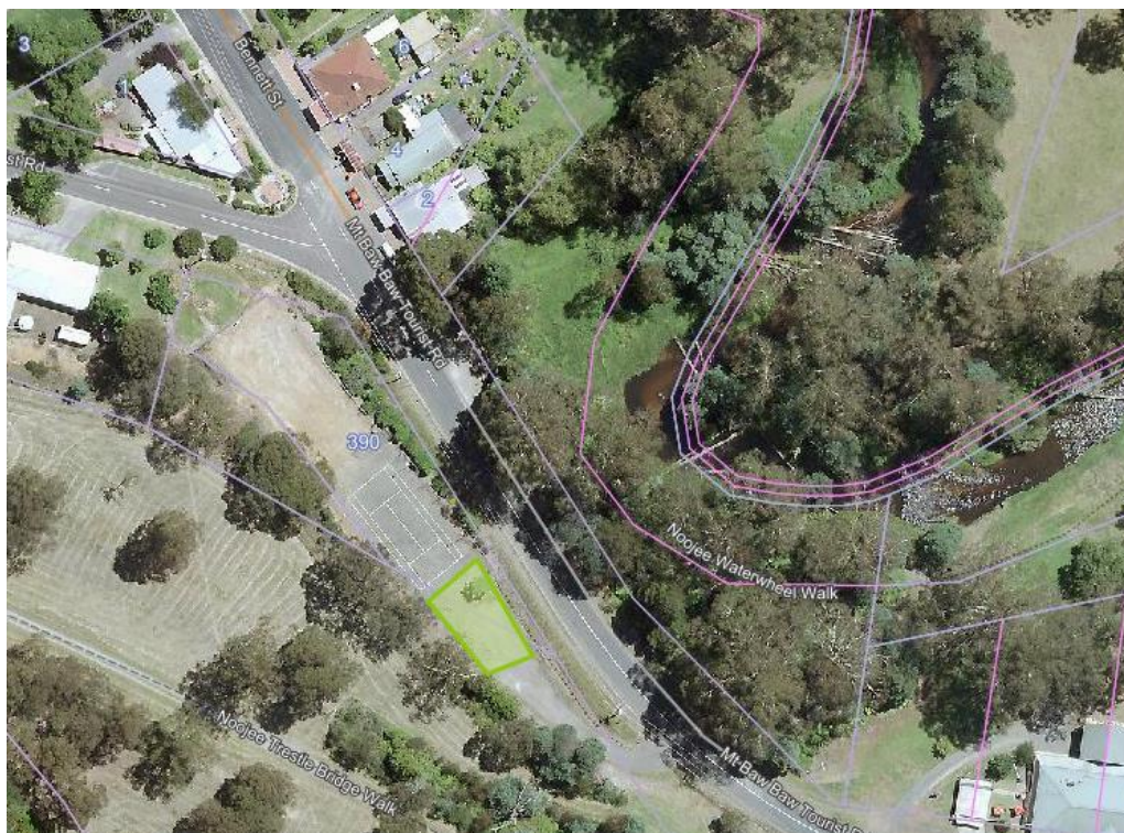
Photograph 5 Potential location for central car park