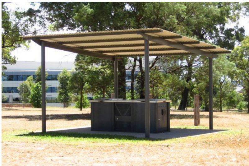
Photograph 1 Example of BBQ facilities and shelter