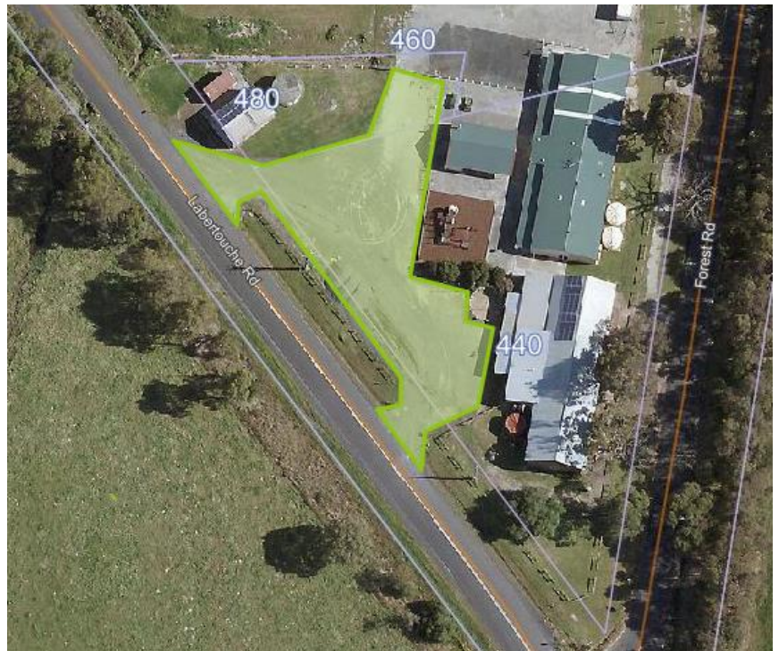
Figure 1 Community Centre carpark asphalt seal area

As this is a large area, this option will only be one stage with further stages being completed in future car park programs run by Council.