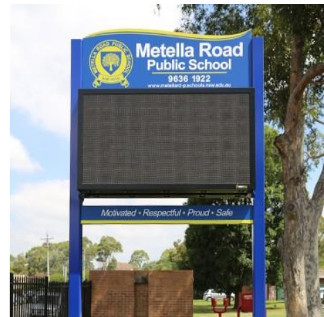
Figure 2 Example of electronic signage

It is estimated that this project will cost approximately $20,000 to complete. A provisional sum of $5,000 to undertake any necessary electrical trenching work.