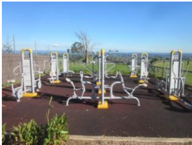
Figure 5 Outdoor gym equipment at Kydd Parke Reserve, Jindivick