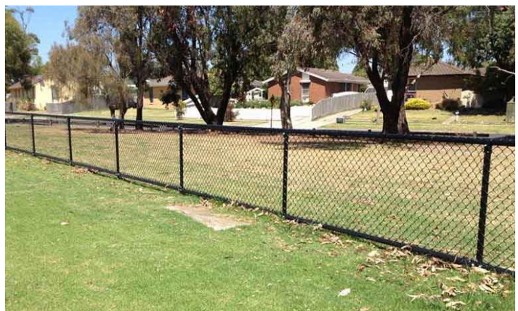
Figure 4 Example of 'cyclone style' fencing

Works would be undertaken on DELWP owned land and permission would be sought prior to works commencing.