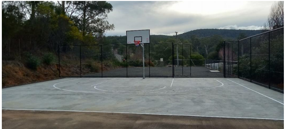
Figure 8 Basketball half court in Noojee

Construction of a basketball half court including line marking for basketball and four-square at the community centre. Works would be undertaken on DELWP owned land and permission would be sought prior to works commencing.