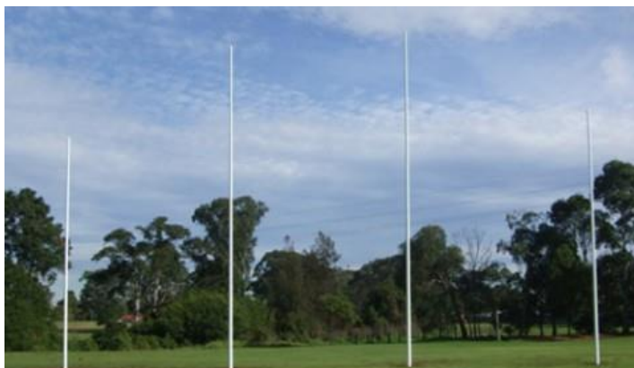
Figure 6 Example of football goal posts

A set of multi-use goal posts to be installed on one side of the oval to provide a space for casual physical activity (including AFL or soccer). The works will require construction of footings and supply and installation of the goal posts. Works would be undertaken on DELWP owned land and permission would be sought prior to works commencing.