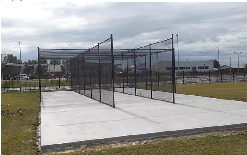
Figure 7 Example of cricket net with concrete slab and chain mesh fencing