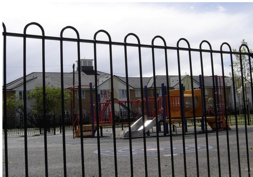
Figure 3 Example of 'pool style' fencing around a playground

Works involve ensuring that appropriate fall zones for the play equipment are met prior to the installation of fencing. 'Pool style' fencing would be constructed around the playground which totals 50m at an approximate rate of $150/m for supply and installation. A provisional sum of $5,000 has been included to undertake any necessary works to the timber edging. Works would be undertaken on DELWP owned land and permission would be sought prior to works commencing.