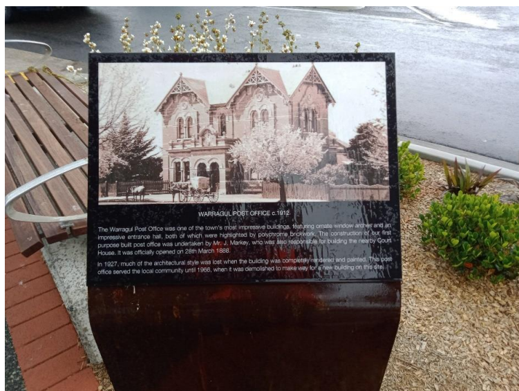
Figure 4 Example of historical signage from Palmerston St, Warragul

It is expected that each sign could cost ~$3,000 to design, supply and install.