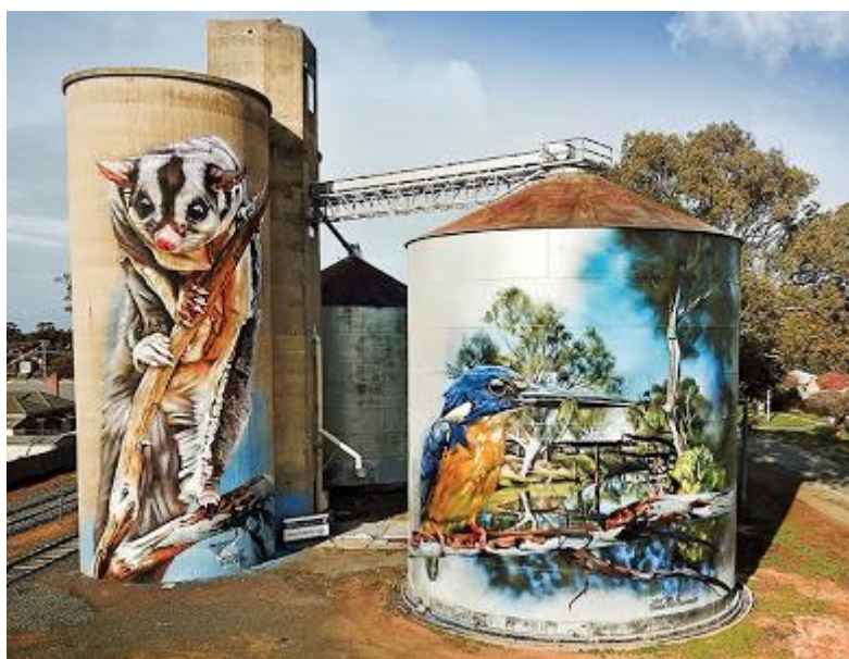
Figure 8 Example of 'silo art' style in Albury, NSW

After an appropriate location has been selected by the community, the project will involve hiring an artist to develop concepts of art that are taken back to the community for approval. The art would be in the style of 'silo art'. The preferred concept chosen by the community would be painted at the preferred location.