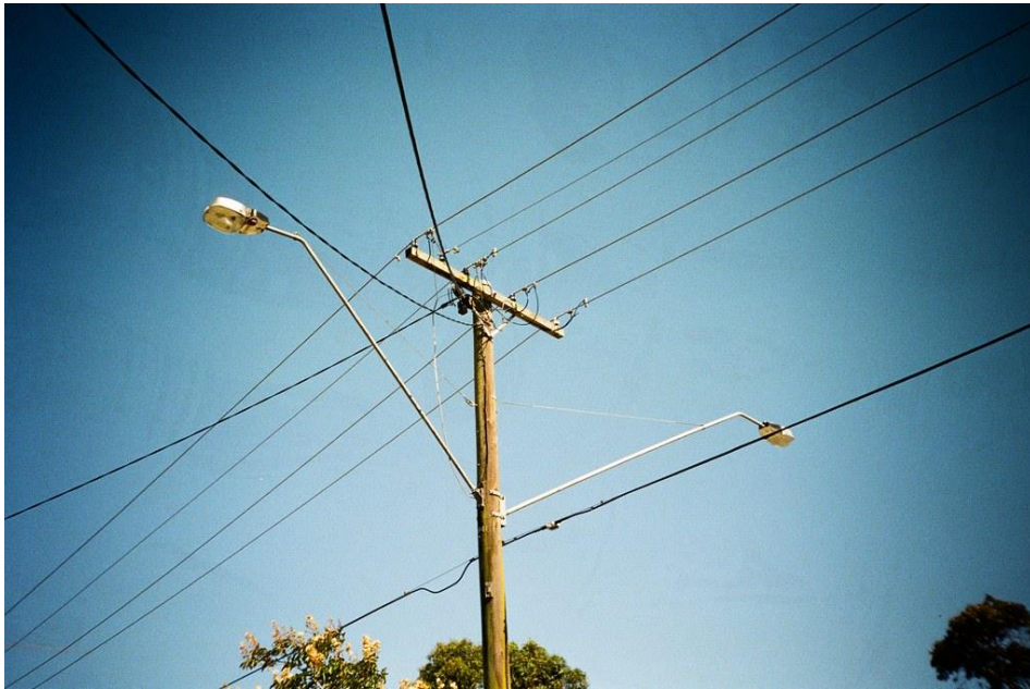
Figure 9 Street lighting on a power pole

This project provides the opportunity to utilise existing power poles to install street lighting along footpaths on Cropley Street and Gaul Avenue. It is estimated that for each existing pole, $4,000 is required to install a new light fitting and mounting arm to the existing electrical infrastructure. Installation to be co-ordinated with AusNet Services who currently manage this infrastructure.