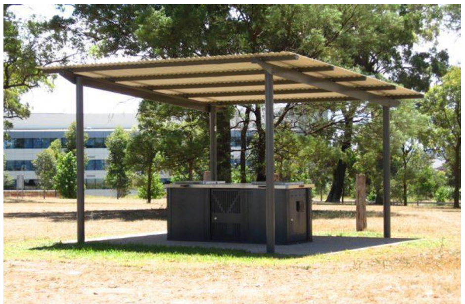
Figure 2 Example of BBQ facilities and shelter

Provision of new public BBQ facilities as well as water fountain facilities to the park at the Memorial Hall next to the playground.