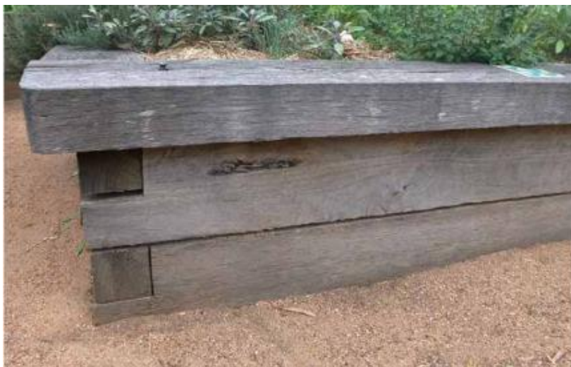
Figure 6 Example of a raised garden bed for installation in the main street

Inclusion of canopy trees has been considered as part of this project.