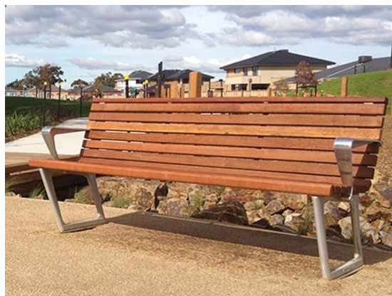
Figure 7 Example of new seating

Consultation with the community will occur if this option is preferred to ensure that the works meet the community's expectations.