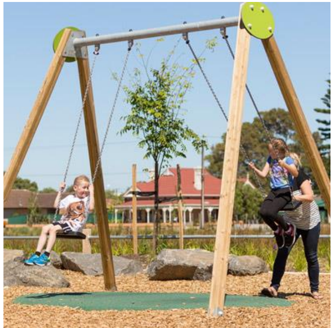
Figure 3 Example of potential play equipment

It is expected that this project would require the full budget to construct.