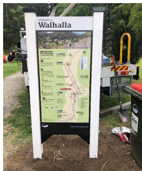
Figure 5 Example of map sign in Walhalla

It is expected that each sign will cost approximately $5,000 each to design and manufacture. An allocation of $5,000 will be used to install the signs.