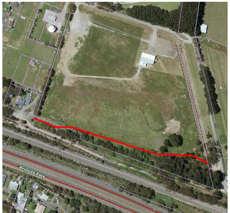
Figure 10 Gravel path to link the Historical Precinct loop

Works would be undertaken on land owned by DELWP and permission would be sought prior to works commencing. Consultation with the Baw Baw Old Engine & Auto Club would also be undertaken.