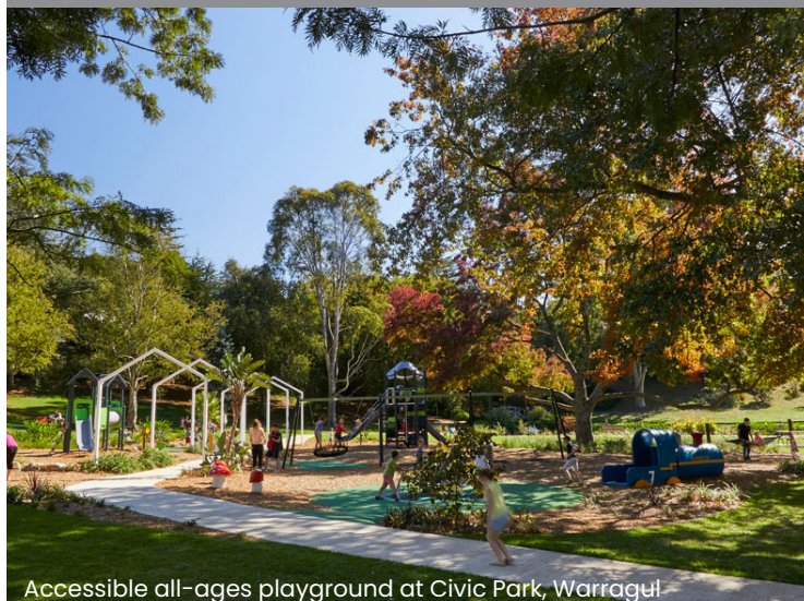
Accessible all-ages playground at Civic Park, Warragul

Land for the proposed facility is owned by Council and shovel-ready for development.