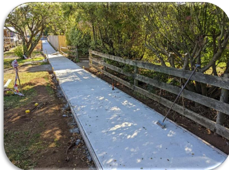
Hamilton Street, Thorpdale