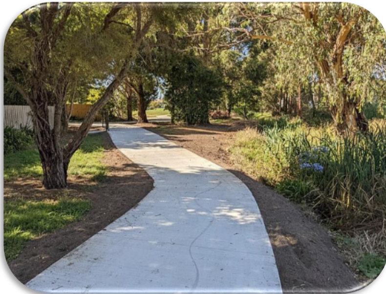
Dawson Drive Access Reserve, Warragul

Designs have been finalised for footpaths on Tyers-Walhalla Road, Rawson and Mount Baw Baw Tourist Road, Noojee, and RRV have provided approval for both of these works to proceed. The procurement process is underway, and it is expected that works will commence when weather conditions become more suitable, with anticipated completion in October 2022.