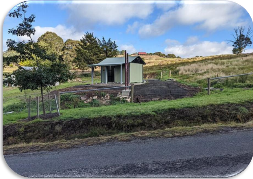
New toilet block at Aberfeldy