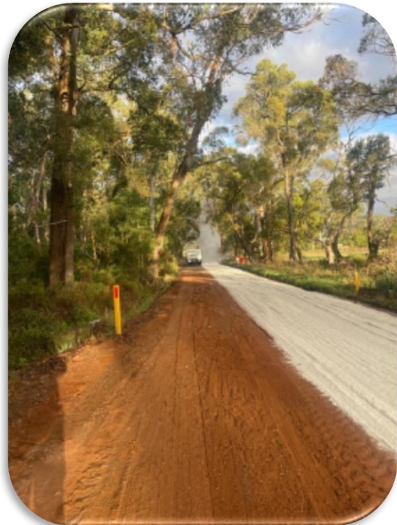
Nilma Shady Creek Road – Lime Stabilisation