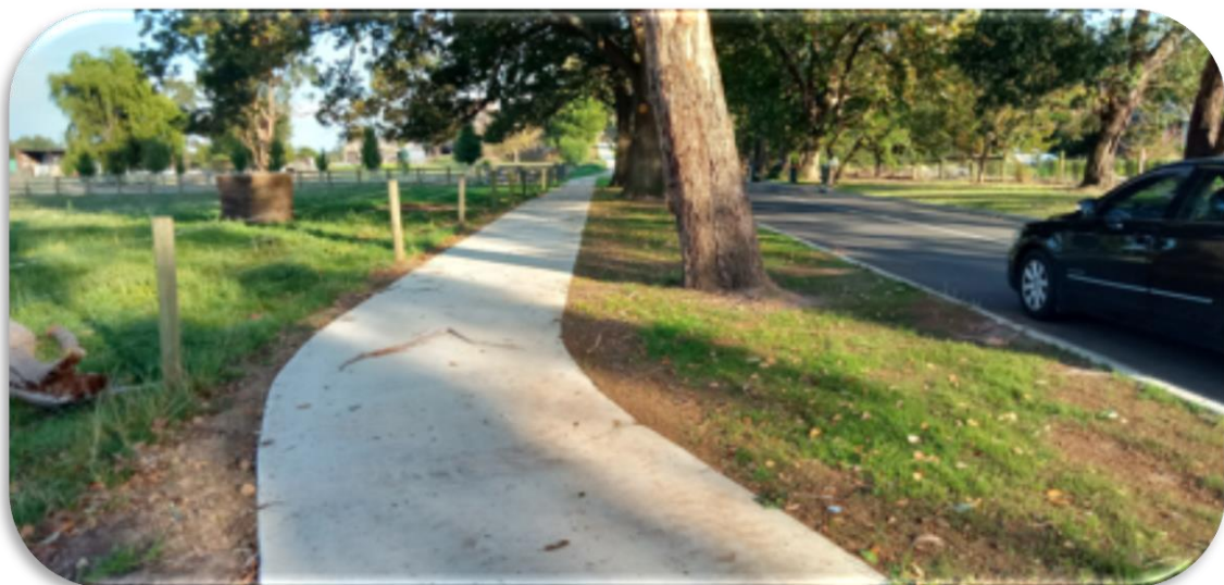
Shillinglaw Road footpath

Construction of all footpaths included in this program are now complete, except the footpath in Church Street, Drouin. Due to the impact that the current design for the Church Street footpath will have on a number of trees in the area, further assessment is required, which may result in a change in scope being recommended.