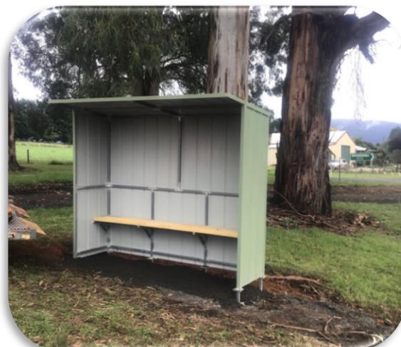
Bus Shelter at Erica

All shelters have now been installed and this project is now complete.