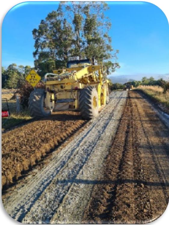
Neerim East Road – Mixing Work