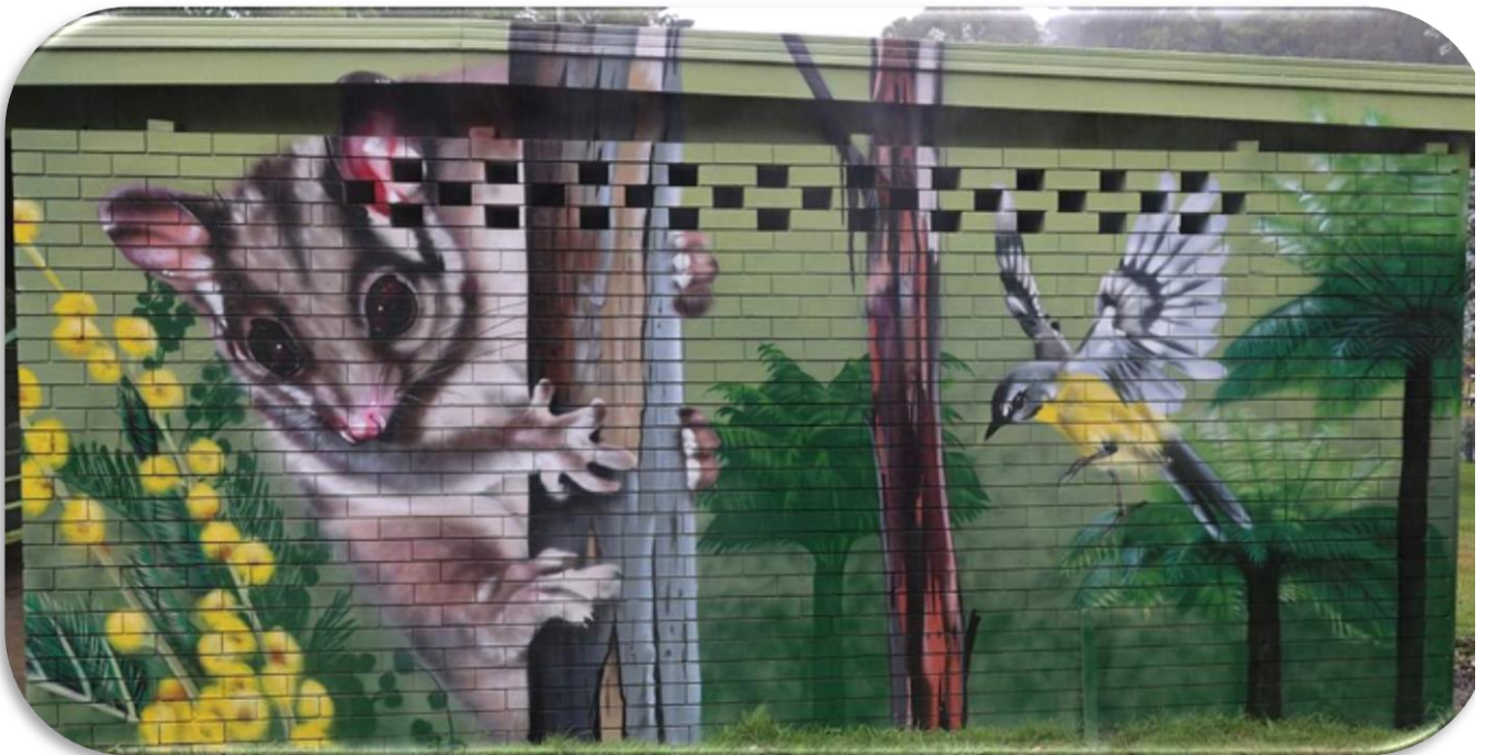
Mural at Tanjil Bren

The mural at Tanjil Bren has been completed. Restoration works for the Pioneers Board are underway and are now scheduled to be completed in May, with installation of the board planned in June 2022.