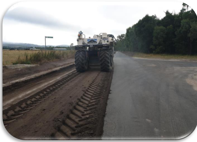
Reconstruction works at Jackson's Track, Labertouche