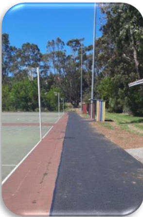
New asphalt on courts 1 & 2

The procurement process was completed in Q2. Works have commenced and are expected to be completed in March 2022.