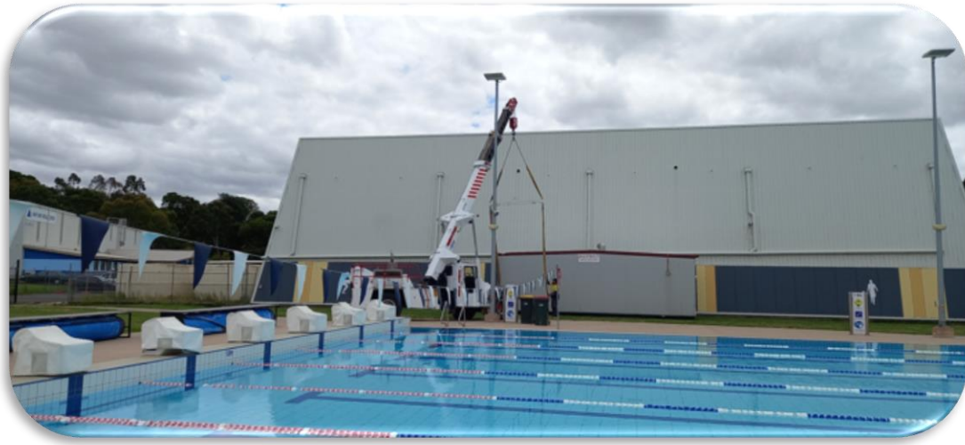
Relocating the Warragul Swimming Club's existing hut with a 22T Franna crane