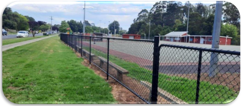
New fencing and access gate