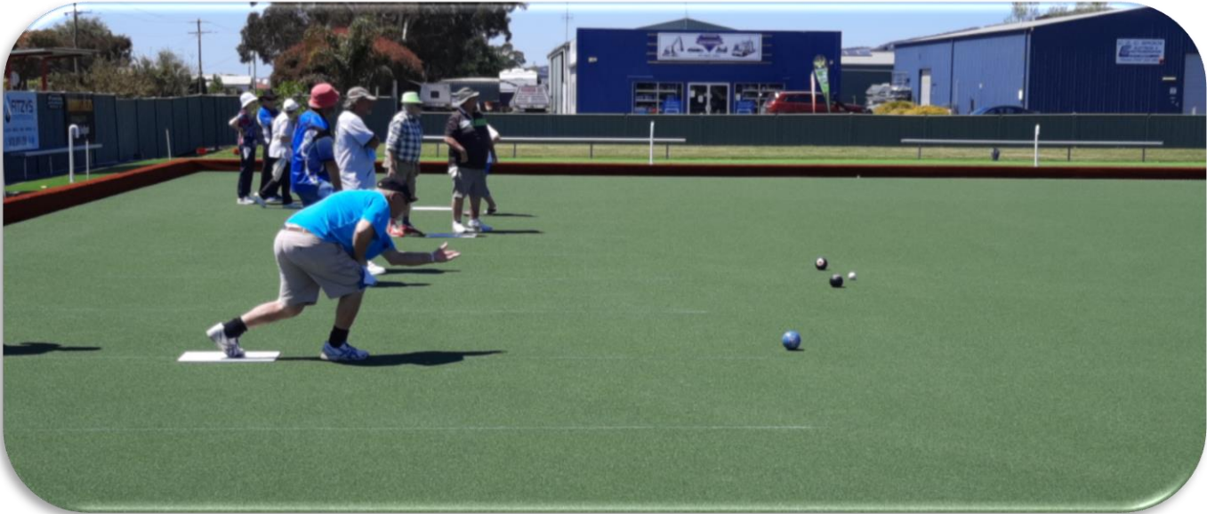
New synthetic bowling rink at Trafalgar Bowls Club

Works have been completed with the new synthetic pitch in full operation. Council will work with the club to finalise the grant acquittal during Q3, and an official project opening with State Government and Council representatives is being planned for Saturday 5 March. This project is complete, pending receipt of final invoices.