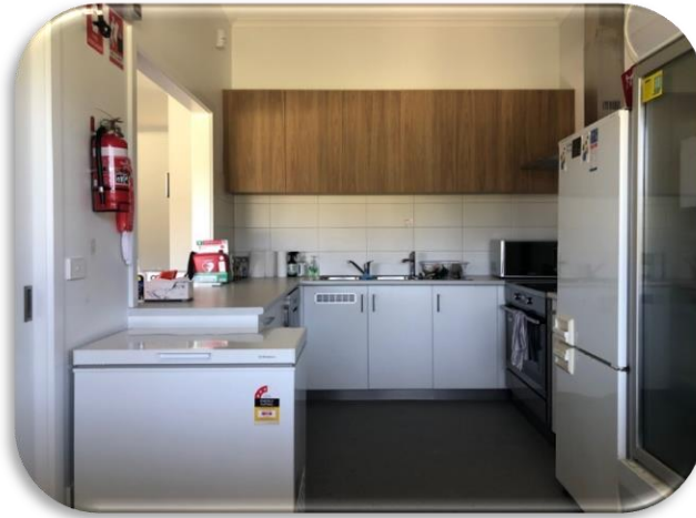
Balmoral Park Tennis Club Rooms, Drouin