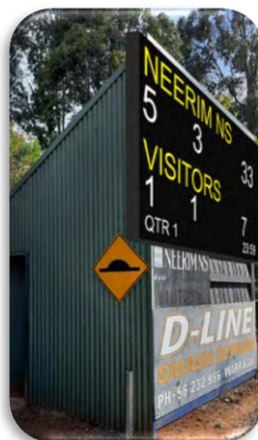
Artist's impression of the new scoreboard

During Q2 a request for quotation process was undertaken, and a contractor was engaged to carry out the works. Relevant permits are awaited, with works are expected to take place during Q3 with project completion in February 2022.