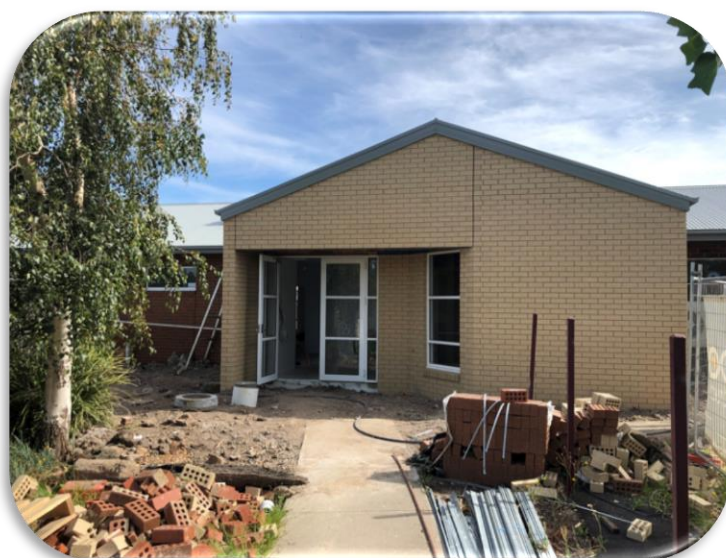
Longwarry Early Learning Centre

The Longwarry Early Learning Centre is at lock up stage, with all the brickwork, windows, doors, plaster, painting and roofing completed. Joinery and fit off will commence in January 2022 and works are expected to be completed by April 2022.