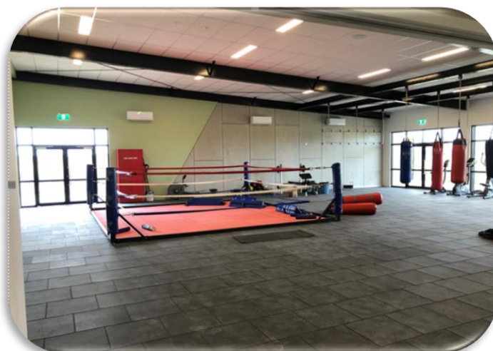
Turra Pavilion Boxing Gym

Works on site are now 95% complete, with the pavilion complete and ready for the clubs to move in during January 2022. The demolition of the existing boxing gym will take place after the Boxing Club commence operating in the new pavilion.