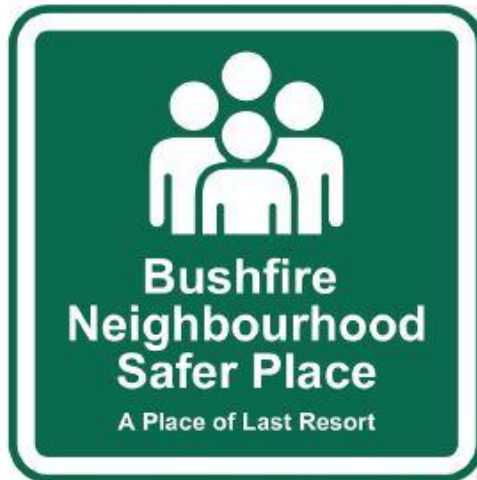
This is the signage that will identify a Neighbourhood Safer Place – Place of Last Resort.